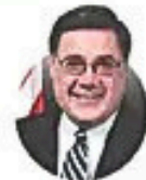
FROM THE OFFICE OF SUFFOLK COUNTY EXECUTIVE ED ROMAINE