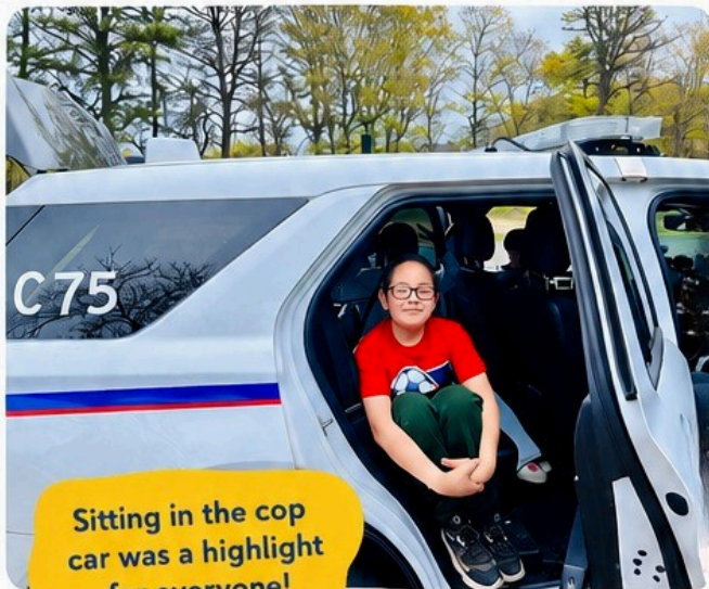
Sitting in the cop car was a highlight for everyone!